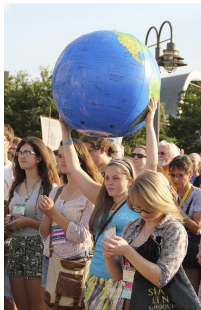
UUs rally for environmental justice in Louisville, KY

Learn more & read the report ( https://www.uua.org/ga/off-site/2019/workshops/climate-change )