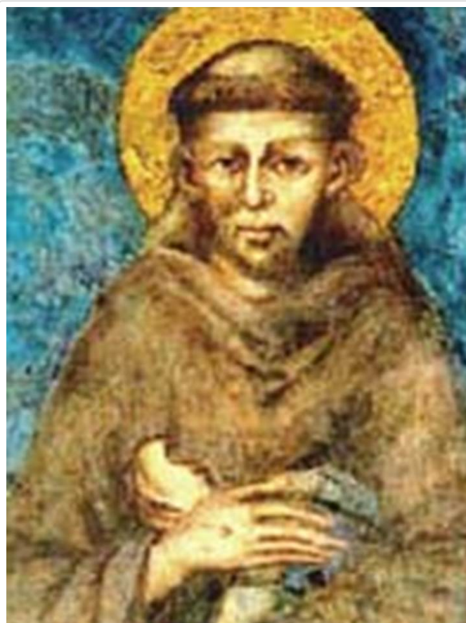
St Francis of Assisi, the patron saint of ecology.

Copied with permission from the Alliance of Religions and Conservation (ARC).